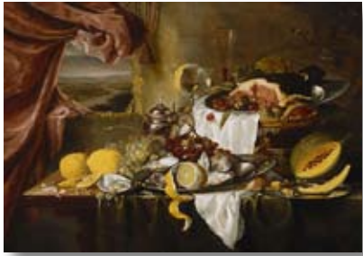
Still life with imaginary view, circa 1646

Deciding what will be on the cover of our CD booklets is a process that often begins even before we have recorded the actual CD! For our last three CD releases we have chosen works of art, which usually requires sifting through hundreds of images worldwide to find just the right one for each CD. Our criterion is usually quite simple – an artwork by an artist from the same country and period as the music we perform on the CD. For our last Italian CD, this meant finding a painting by an Italian artist working between 1600 and 1650. Guido Reni's beautiful painting of the patron saint of music, St Cecilia (1606), fitted our requirements perfectly.